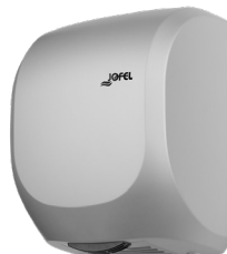
AA19300 8427950363689 Silver finish