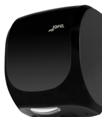
AA19600_MT 8427950369063 Matt black finish