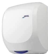
AA19000 8427950352164 White finish