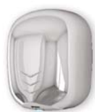
STREAM DRY UV LF