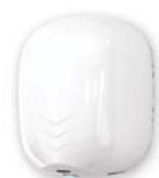
STREAM DRY UV ABS STREAM DRY UV BF