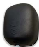
STREAM DRY UV NF