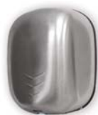
STREAM DRY UV SF