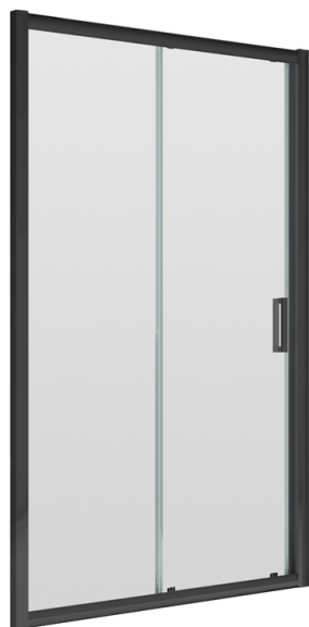
SQ Slider Enclosure

Description: 1200X1850mm Sliding Shower Door